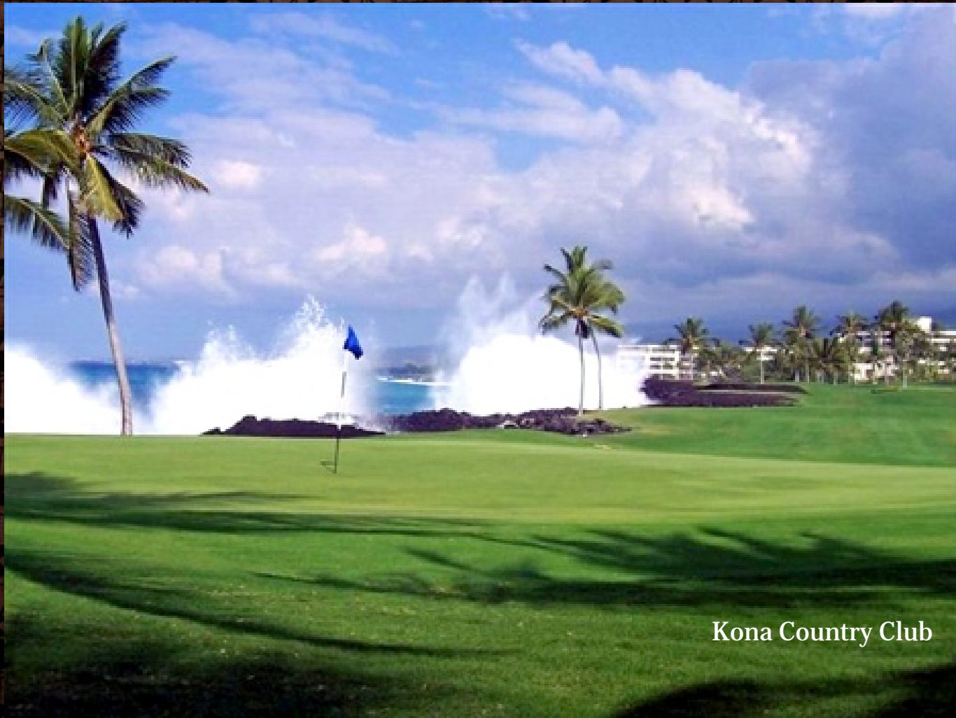
Kona Country Club